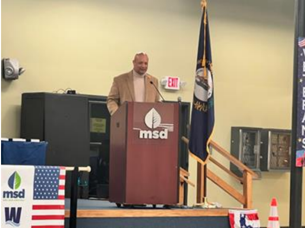
Louisville MSD Vet Day Celebration