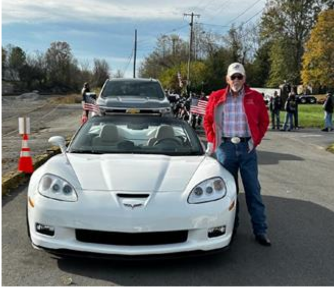
Wilmore Ky Veterans Day Parade