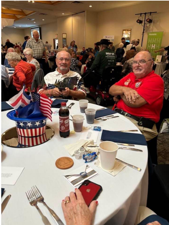
St. Elizabeth Hospital Veterans Luncheon, Edgewood