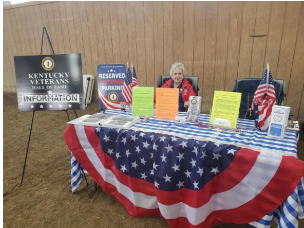
Henderson Horses for Heroes